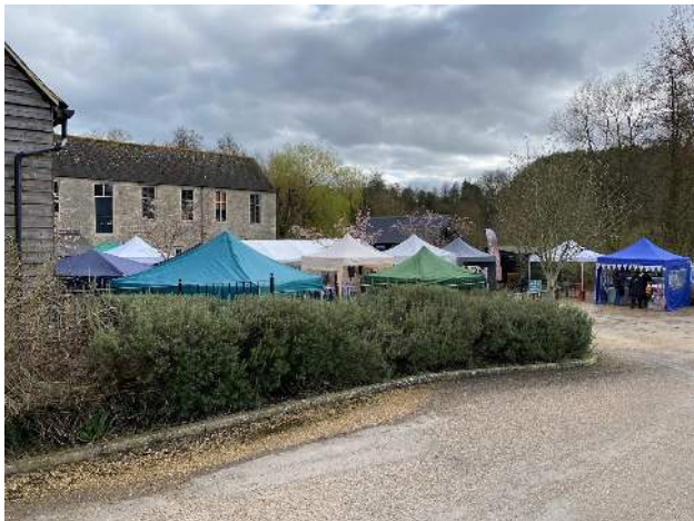
Good attendance of market stalls