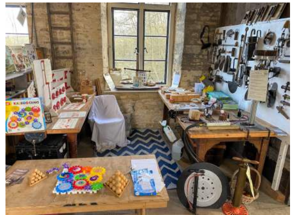
Tinkering area set up for science activities