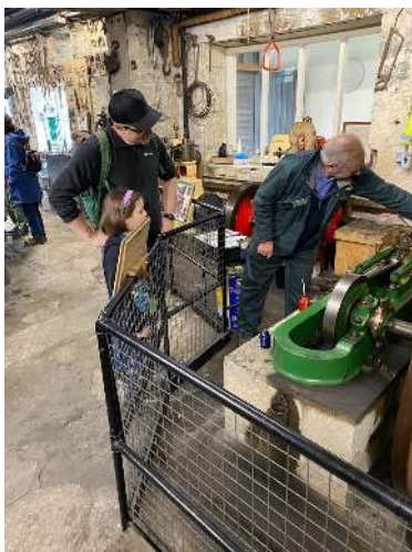
Youngster learning about steam engines