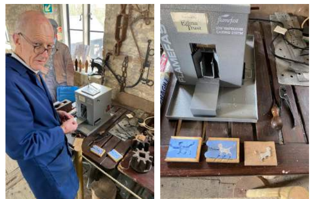
Electric furnace and silicon rubber Millie moulds

If timing is right, holiday visitors will be able to see the casting work in progress.