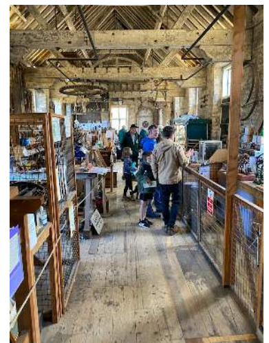
Hot air engines always attract interest