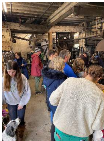
Blacksmiths busy in the forge