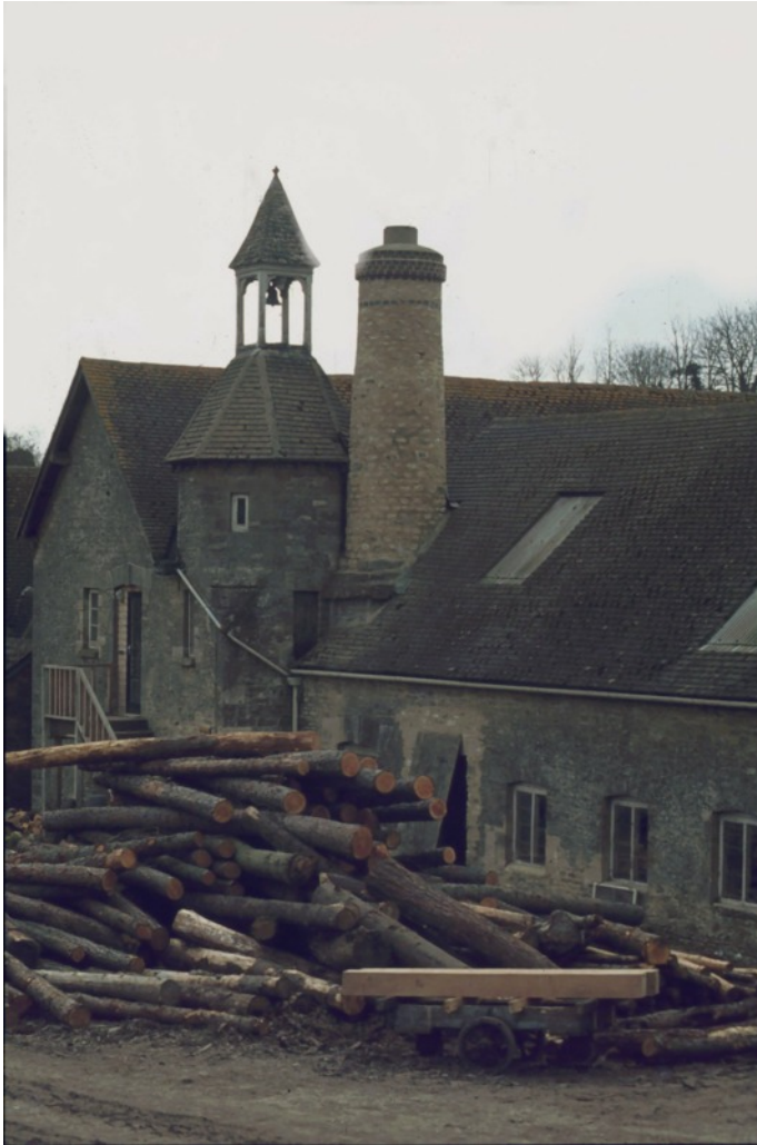
Felled trees waiting at Combe Mill