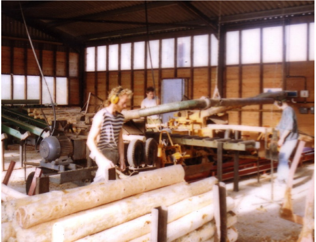
Fencing products being made at Combe Yard