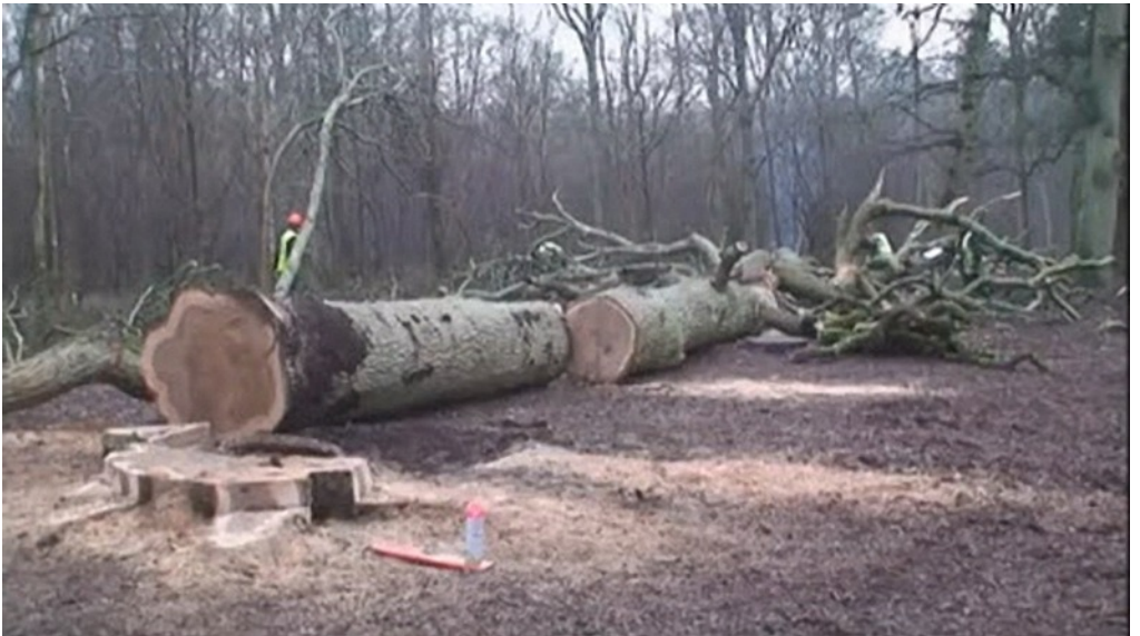
One Oak - ready for the sawmill