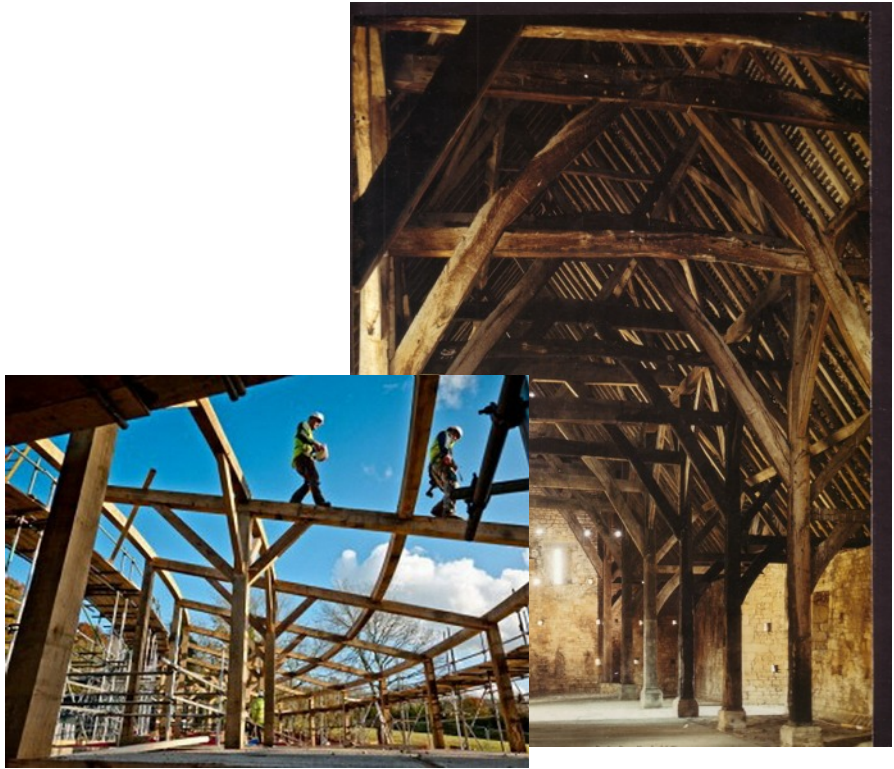
Timber is used to make wonderful buildings