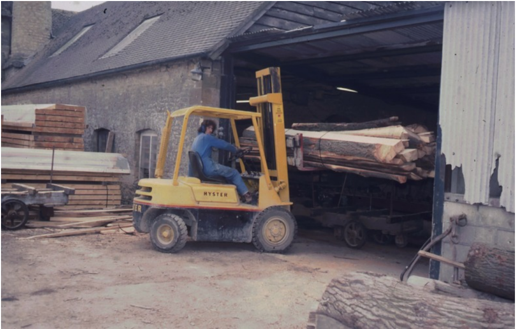
Offcuts being taken away