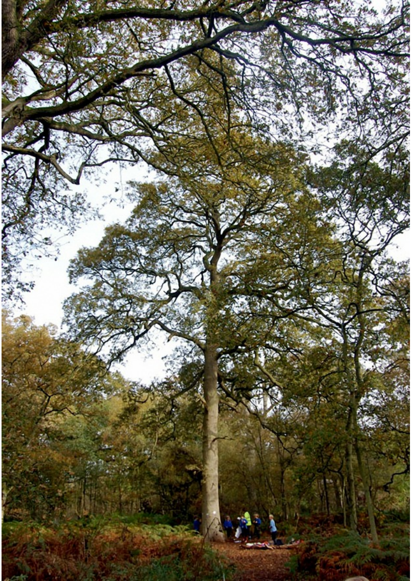
Mature Oak Tree - One Oak January 2010