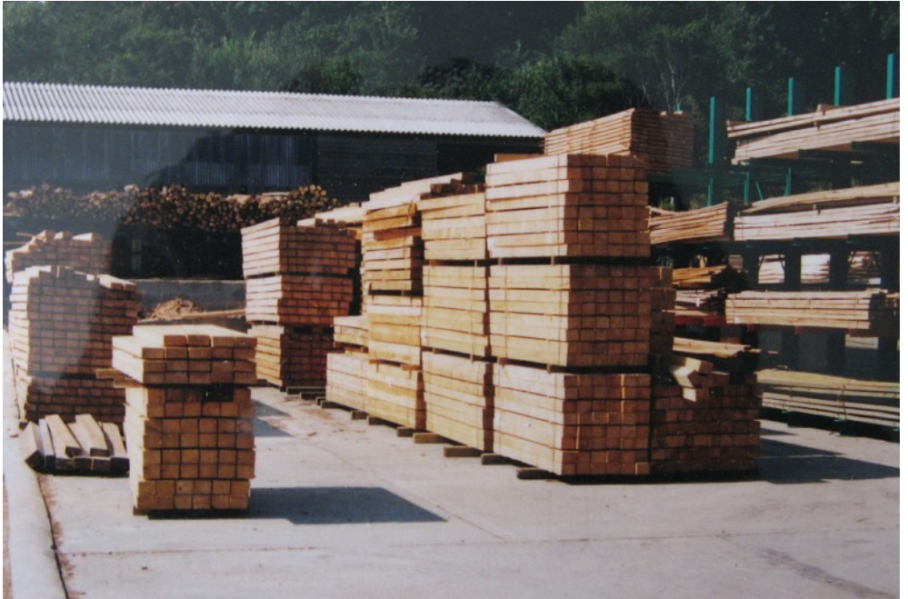
Timber waiting to be sold in Combe Yard