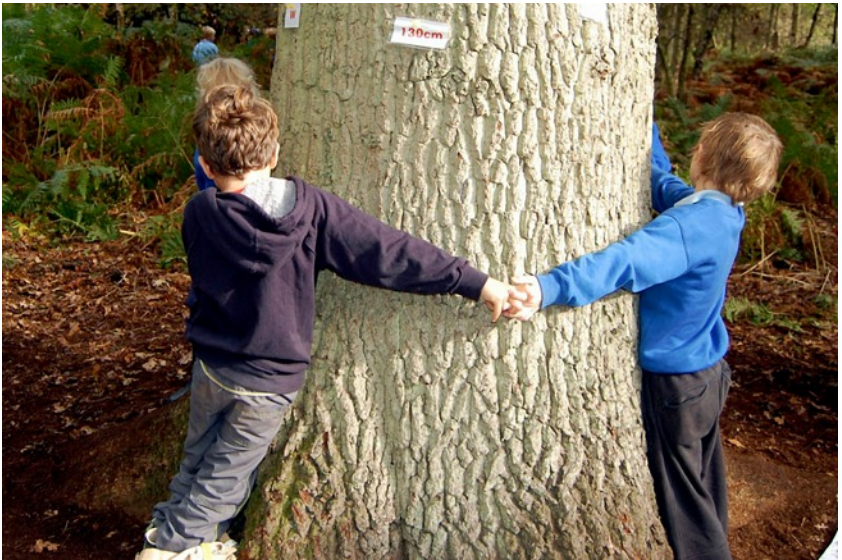
The One Oak was a large tree and very old