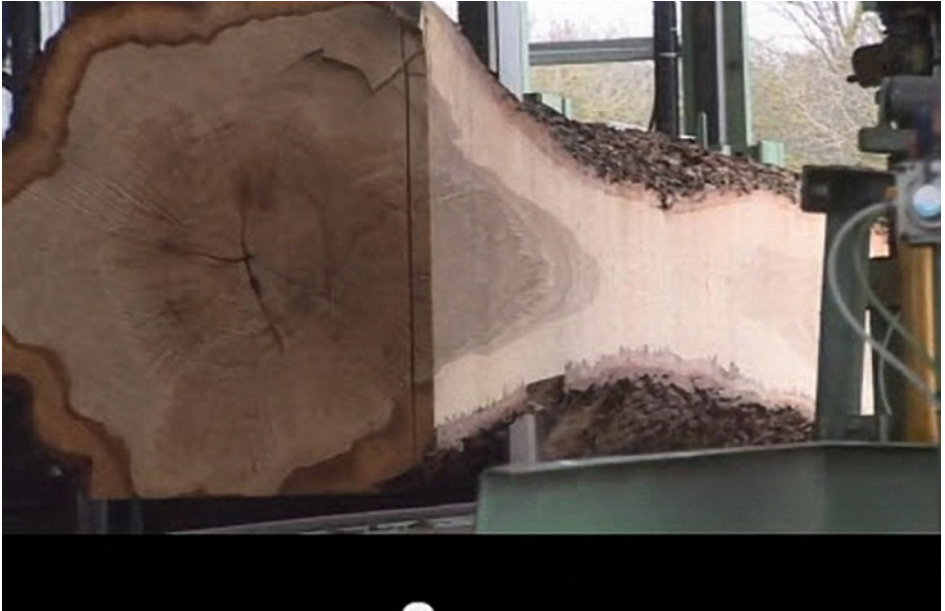
One Oak being sawn into planks