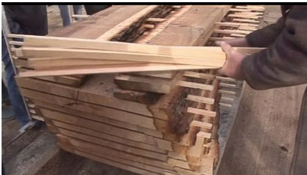
One Oak planks being stacked for air drying