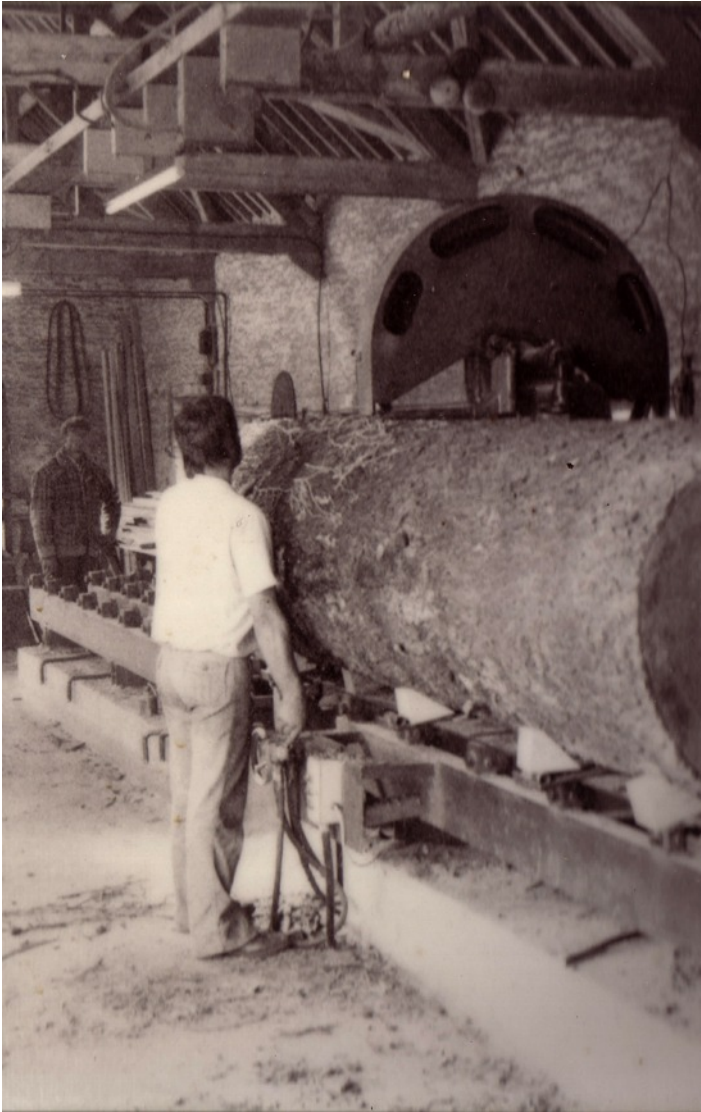
Large tree being sawn at Combe Mill